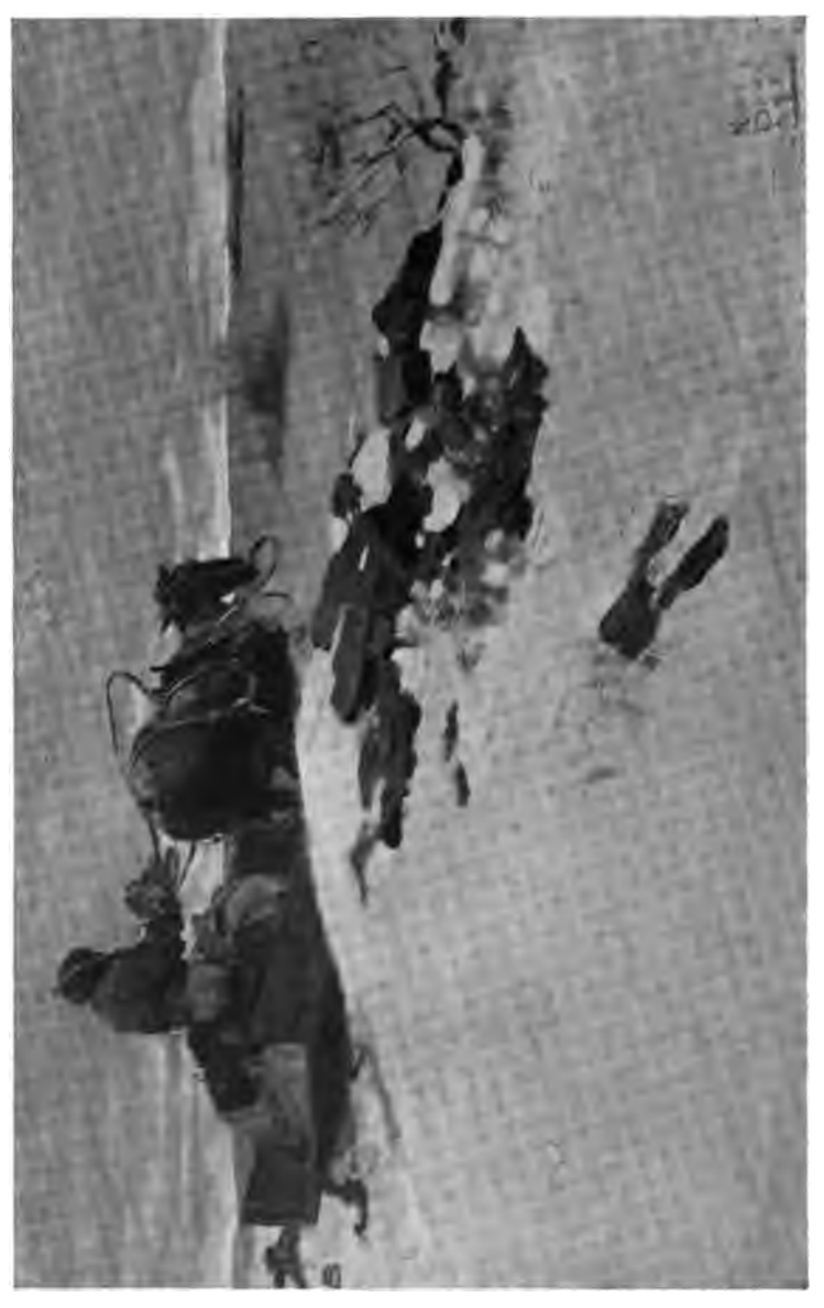
Digitized by Google